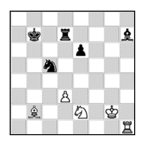
Figure 3: Illustrative position for attack generation

Using the previously realized coding, the contents of the matrices could be represented in a following sequence (elements are in binary numeric system, first column represents offsets):